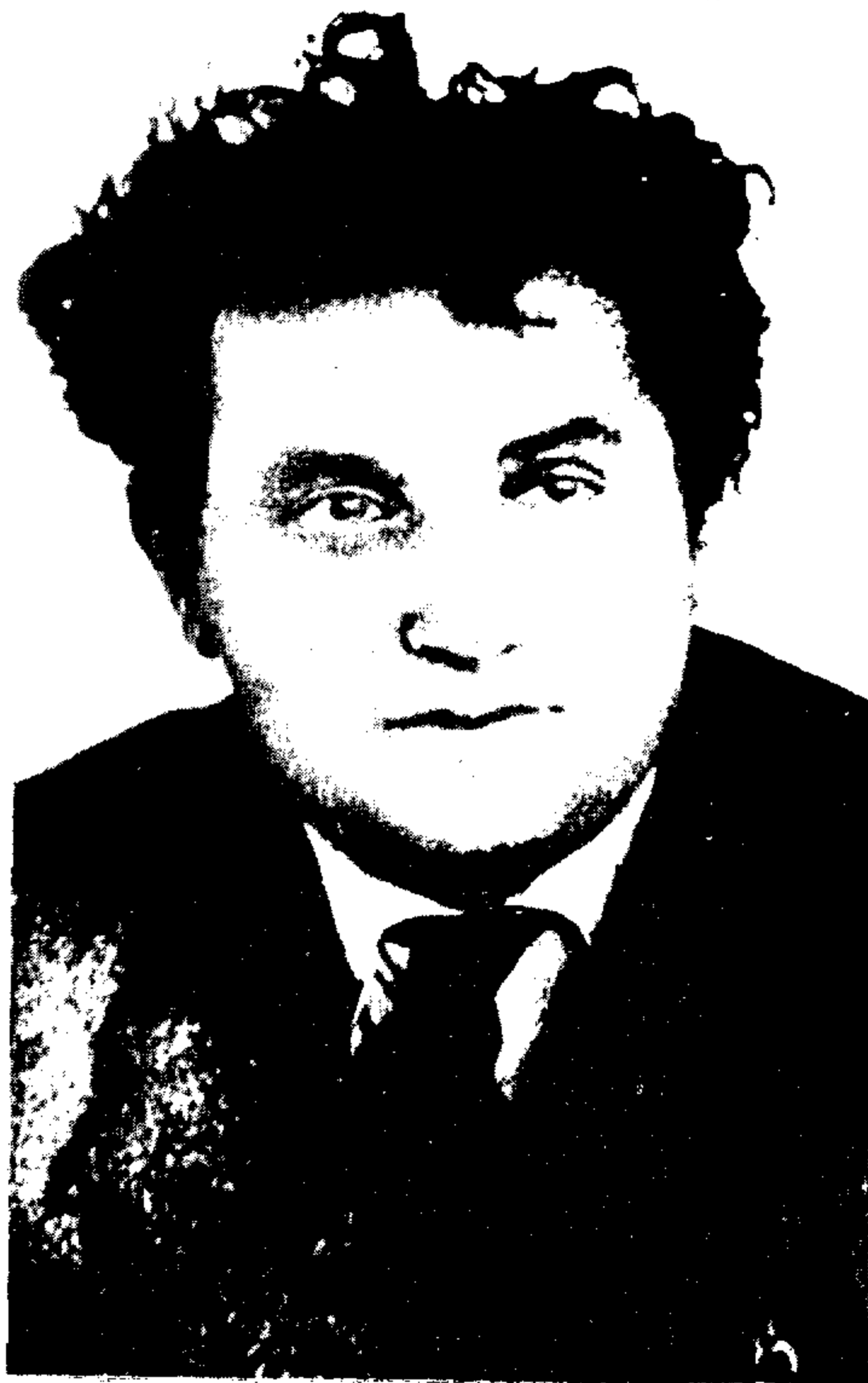
Grigori Zinoviev, President of the Comintern 1919 - 1926.