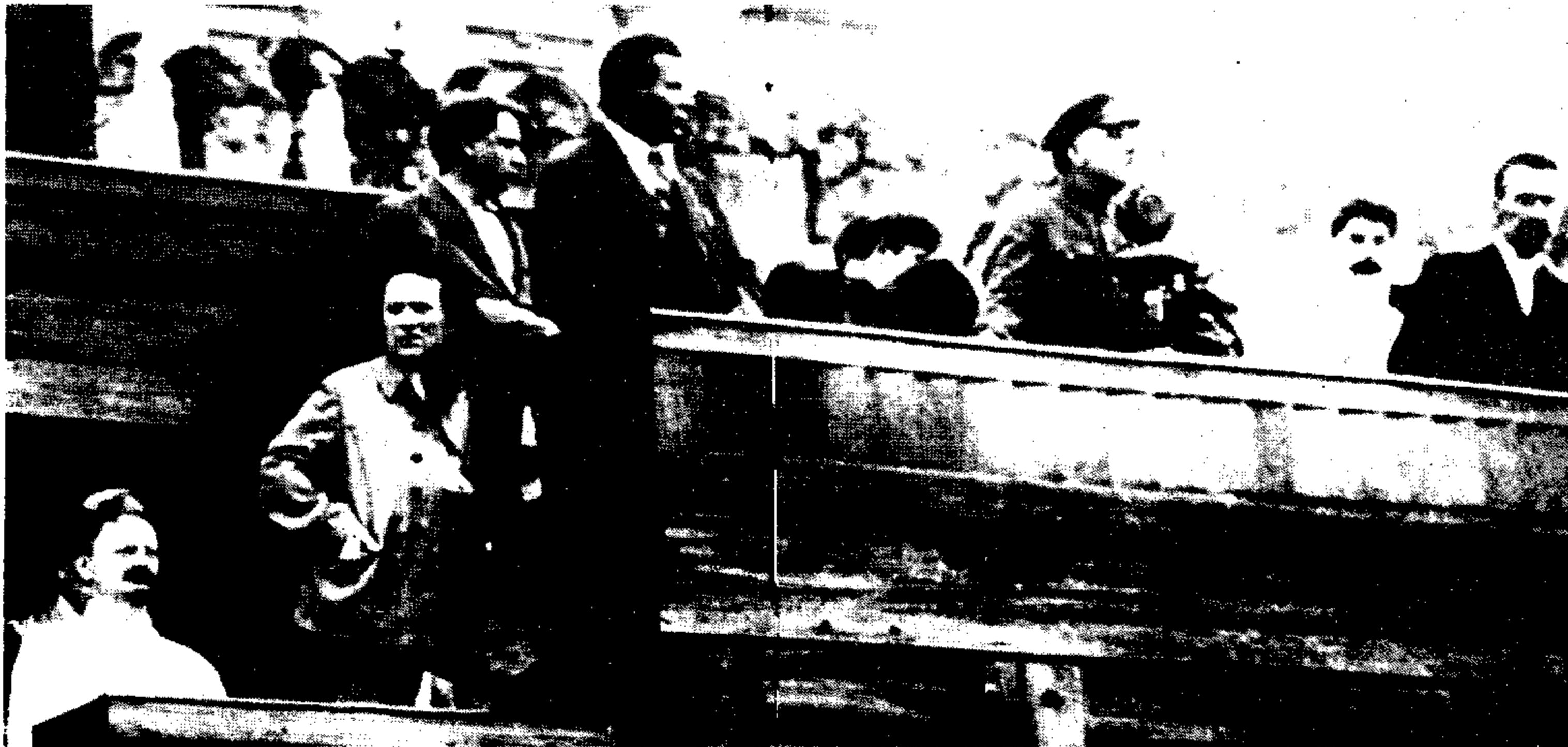
The CPSU leaders 1926. On the left Trotsky and Zinoviev. At the microphone Voroshilov. On the extreme right Stalin and Rykov.

That such confusion existed in the British party on the nature of a 'transitional' programme reflected the debate in the Comintern over the same question. Bukharin at this time was arguing a position along similar lines to Murphy's. Bukharin's draft was put forward to the 4th congress and was referred back. It contained no immediate or transitional demands but was content to put forward only the maximum programme—the marxist position on the state, imperialism, national defense etc. Demands relating to the united front, and the workers government were "really not part of a programme—(but) a programme of action which should deal with purely tactical questions, and